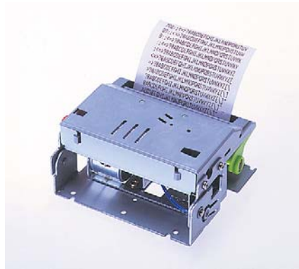
With autocutter M-T102A