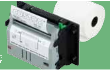
Printing kit with cutter