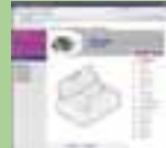
REAL TIME STATUS MONITOR