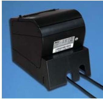
Optional Power Supply Cover with Cable Management Slots