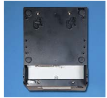
Built-In Wall Mount Capability