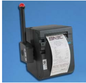
Optional Audio/Visual Print Messenger