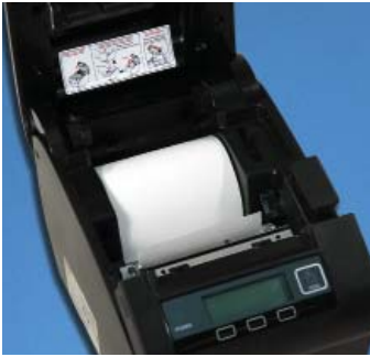
Drop and Print Paper Loading – Optional Paper Width Selector Allows 58mm Wide Paper Rolls