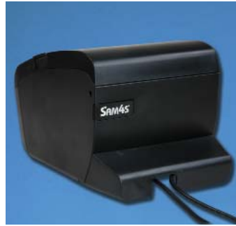
Standard Cable Management Cover