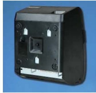
Built-In Wall Mount Capability