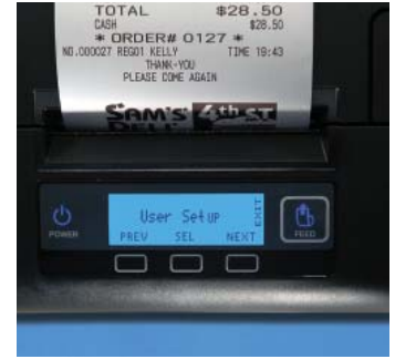
Liquid Crystal Display Guides the Operator Through Setup and Option Selections